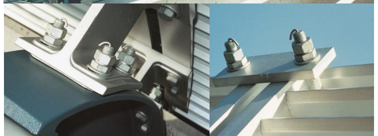
Aluminum Highway Fence (Second Tomei Expressway)