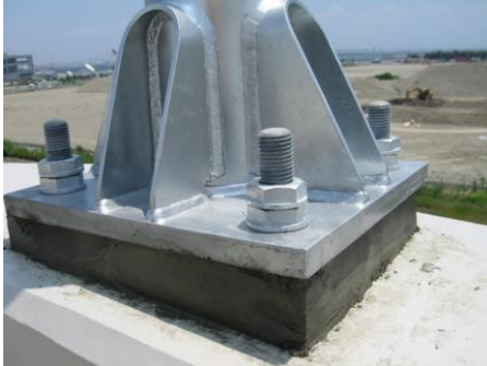
Lighting Columns Anchor Portion (Metropolitan Expressway)