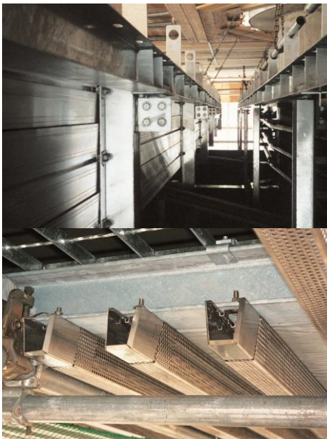
Sound - Absorbing Panels