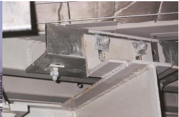
Metal Frame Joint