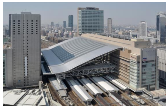
Osaka Station Renewal