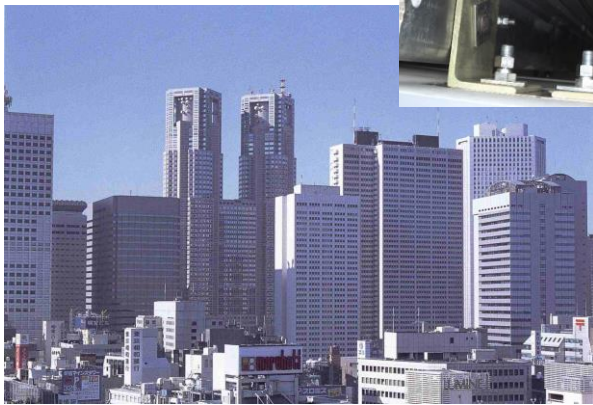
High-Rise Building Exterior Wall & Curtain Wall