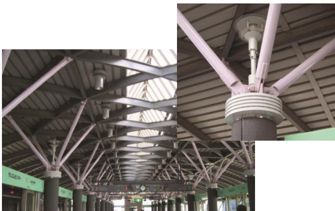
Yurikamome Station Roof